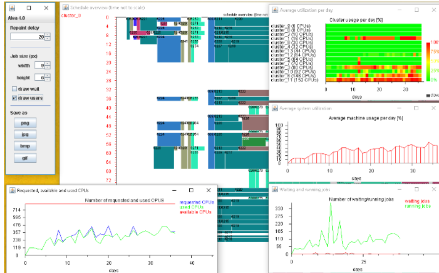
Fig. 3. Alea’s visualization output showing current job schedule and various metrics.

academic and scientific purposes. In this case, Alea has been used to evaluate the impact of new queue setup, where the goal has been to increase fairness, system utilization and wait times across different classes of jobs. Existing conservative setup with 3 major queues (short, normal and long jobs) and rather constraining limits concerning the maximum allowed number of simultaneously running long jobs has been replaced with an improved design introducing new, more fine-grained queues with more generous limits. The promising effect observed in the simulations was then also validated in practice. With the new setup being introduced in January 2014, the overall CPU utilization has increased by 43.2% while the average wait time has decreased by 17.9% (4.4 vs. 3.6 hours) [11].